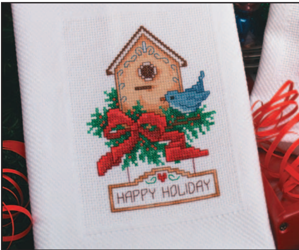
©2008 Herrschners, Inc.