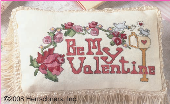
©2008 Herrschners, Inc.