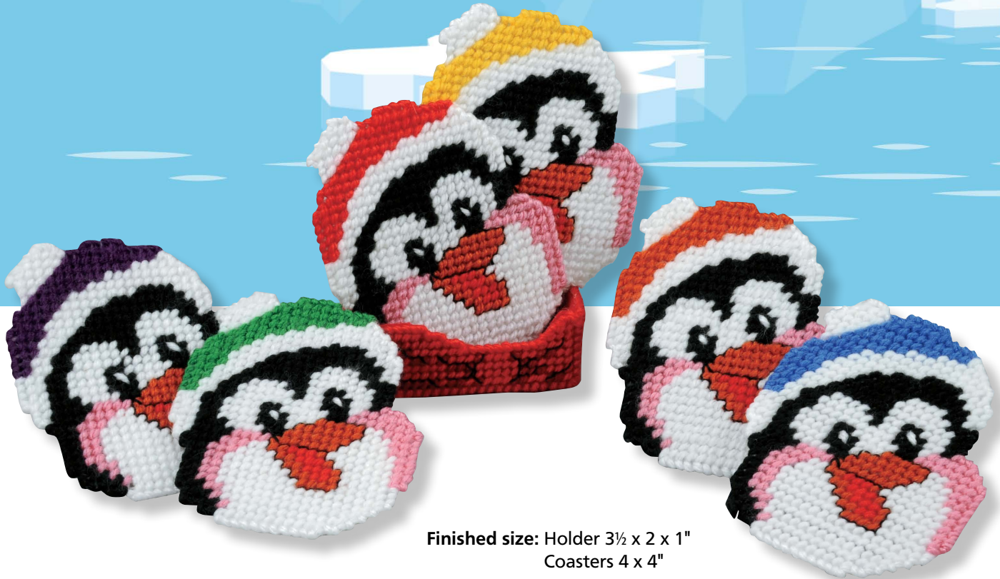
Finished size: Holder 3½ x 2 x 1" Coasters 4 x 4"